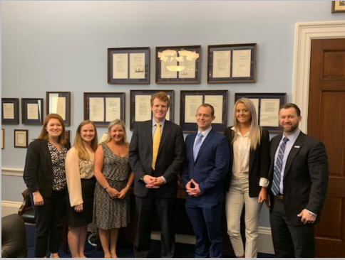
with Congressman Joe Kennedy