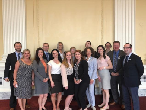
CRNAs and SRNAs on Capitol Hill