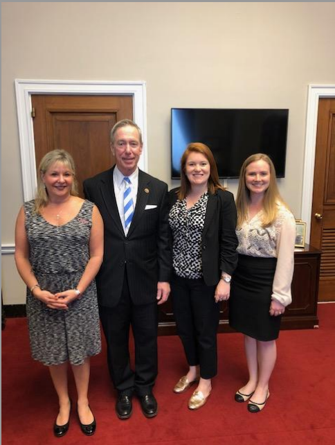
with Congressman Stephen Lynch