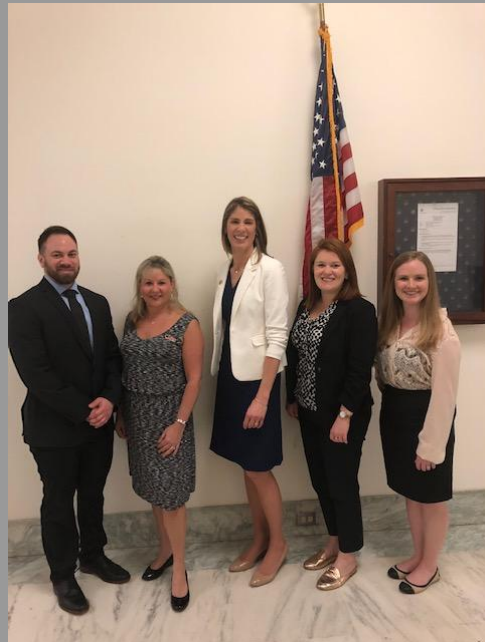
with Congresswoman Lori Trahan