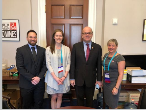
with Congressman Jim McGovern