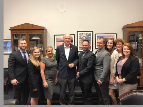
with Congressman Bill Keating